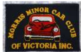
Cloth Club logo patch $10