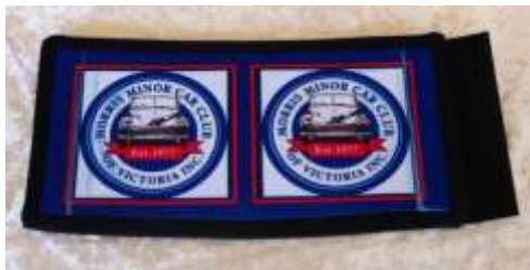
Stubbie Holder $9