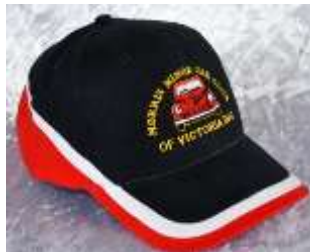
Club Logo Caps $25