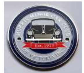
Grille Badge $20