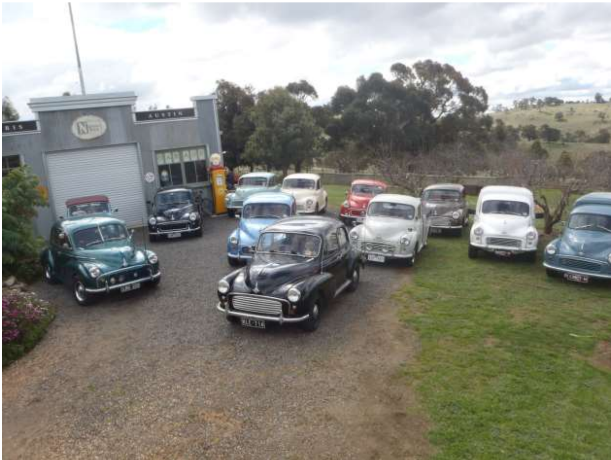
The Morris Minor Garage at North Harcourt, site of this year's "Day of the Morris Minor"