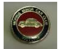
Lapel shirt pins $5