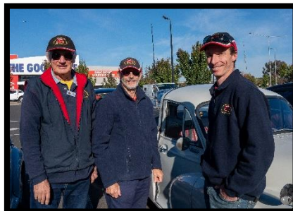
Some of last year's Morrykhana participants.