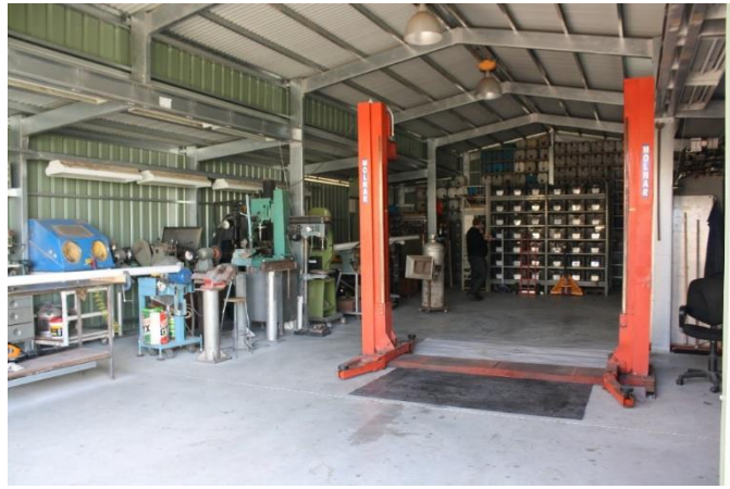
Now this is a Morrie shed