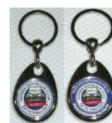
Promo Keyrings $5