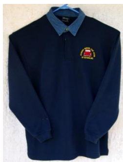
Long Sleeve Rugby $40