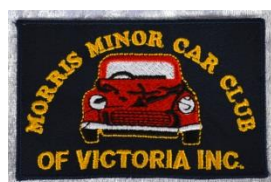
Cloth Club logo patch $10