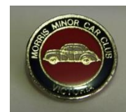
Lapel shirt pins $5