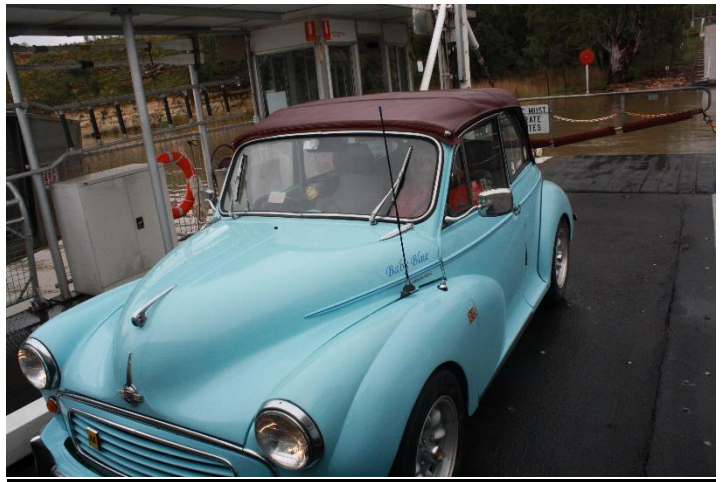
Crossing the Murray by Punt at Cadell