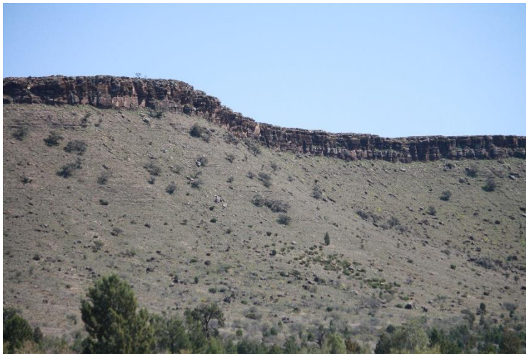
The Great Wall of China at Wilpena Pound