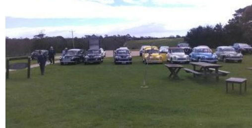
Club Cars at The Briars