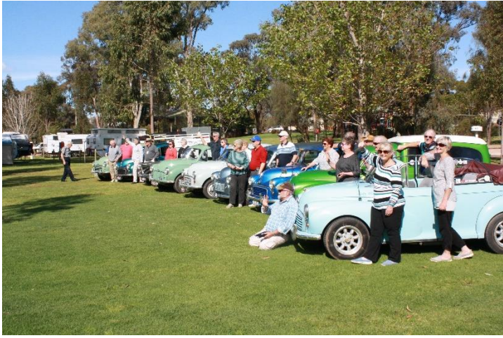
Photo shoot at Robinsvale