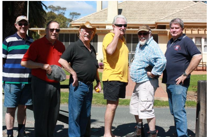
A fine body of Morrie Tourists