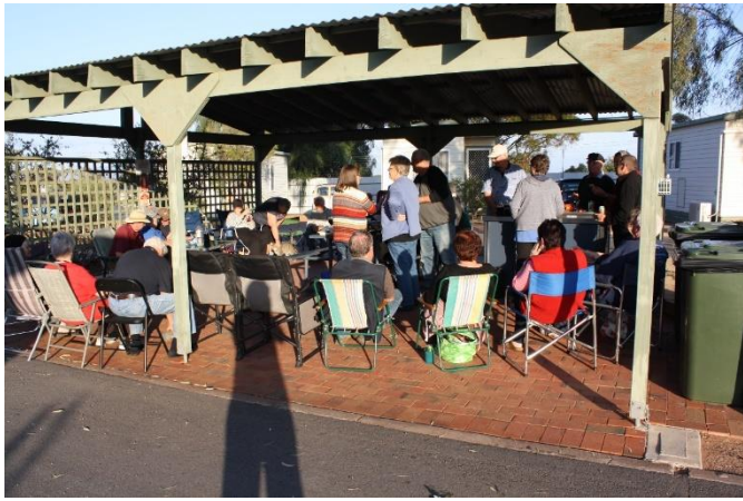
Another famous happy hour