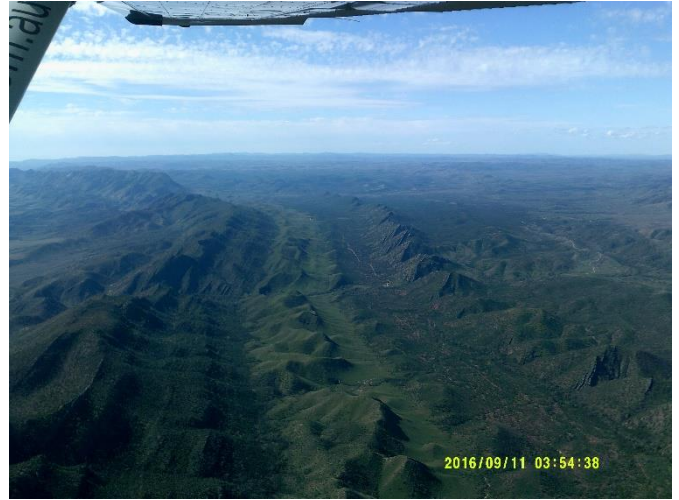
Aerial view of the Wilpena Pound