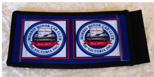
Stubbie Holder $9