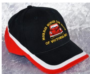
Club Logo Caps $25