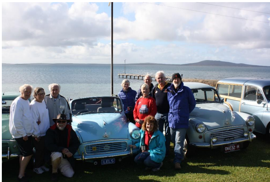
MMCCV Members at Port Lincoln