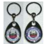
Promo Keyrings $5