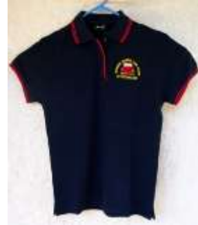
Short Sleeve Polo $30