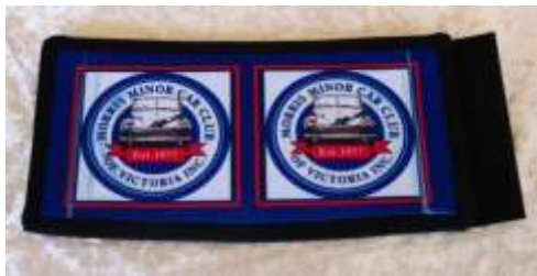
Stubbie Holder $9