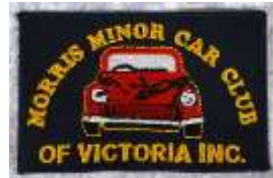
Cloth Club logo patch $10