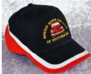
Club Logo Caps $25