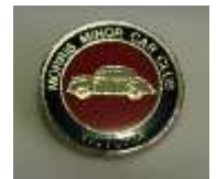
Lapel shirt pins $5