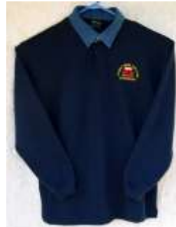
Long Sleeve Rugby $40