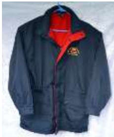
Long Line Jacket $70