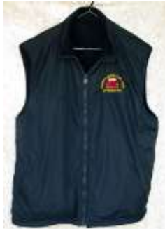
Reversible Vest $45

For purchases contact Graham Harper 03 9439 5791 regalia@morrisminorvic.org.au