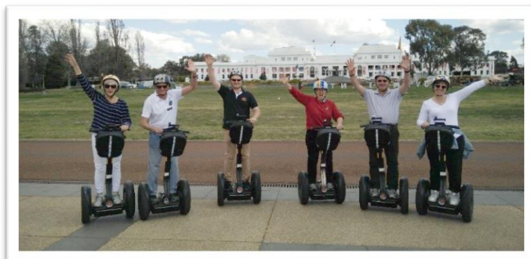
THE SEGWAY SIX