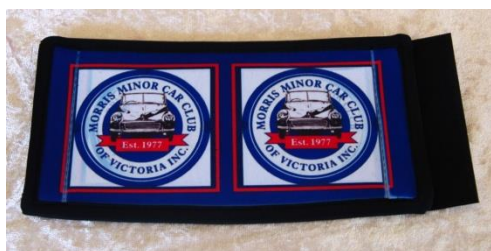
Stubbie Holder $9