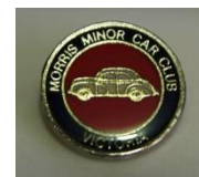
Lapel shirt pins $5