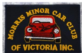
Cloth Club logo patch $10