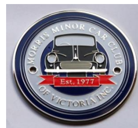
Grille Badge $20