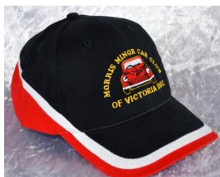
Club Logo Caps $25