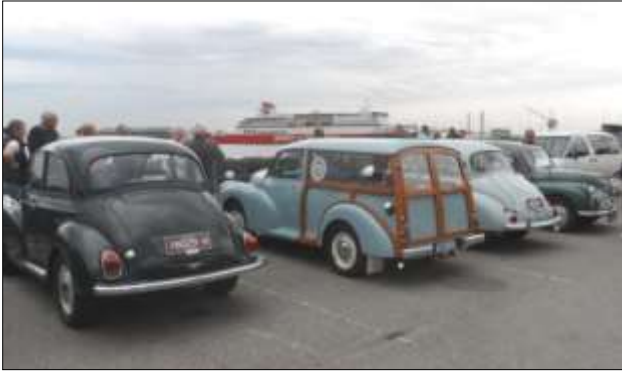
Cars waiting with the Spirit of Tasmania behind

On arrival at Devonport on Tuesday morning we were directed to a park where breakfast was prepared on a BBQ. From there were spread out with Stanley set in the satnavs. Along the way we visited Van Diemens tulip farm at Wynyard, and quaint little seaside villages as we followed the coast to the North West corner of the Island. Each evening we gathered for "happy hour" and shared the day's activities.