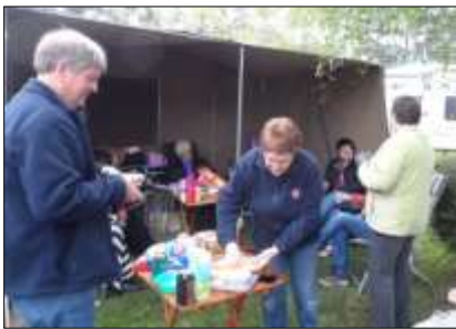
Happy "Two Hours" to wind the day down

Next day we rose early and drove over to Queenstown to ride on a steam train back toward Strahan. It used to come all the way but some bridges were damaged in recent fires and wash-aways so it the loco was turned around for the return trip. This is unique because it connects to a rack to help it up hills.