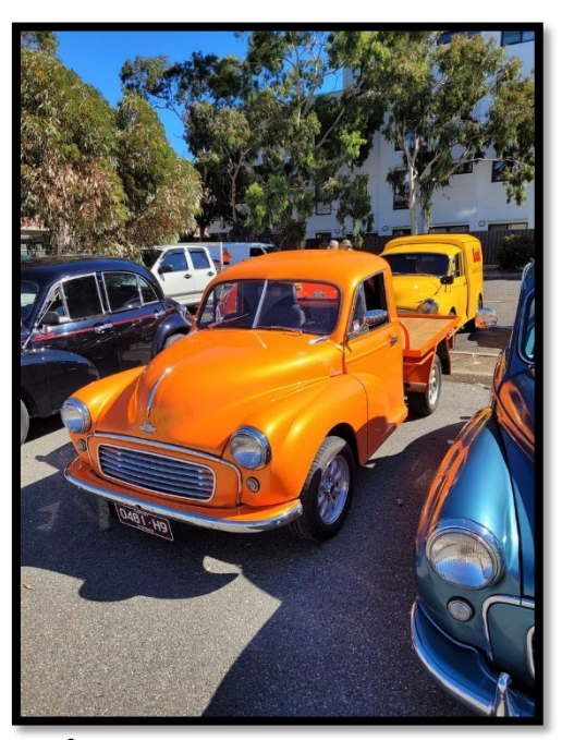
Page 10 of 34