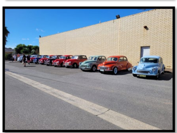
Page 7 of 34