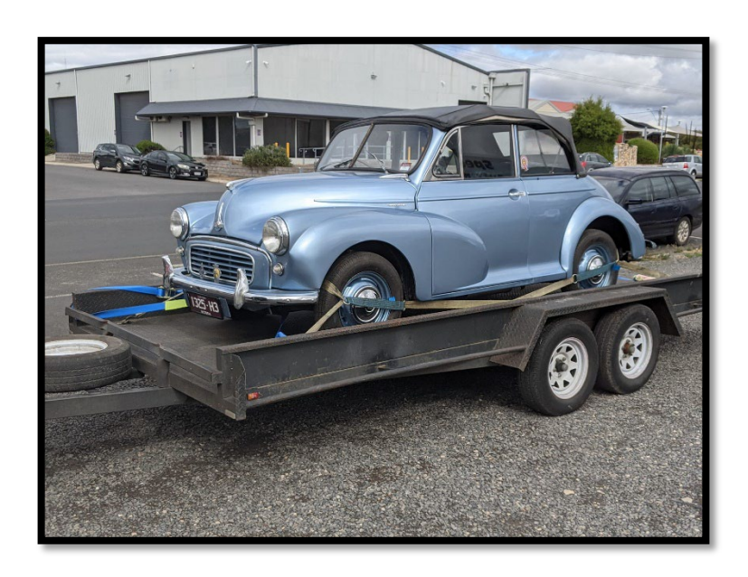
Page 23 of 34