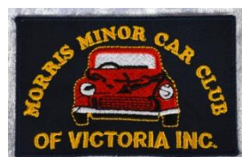
Cloth Club logo patch $10