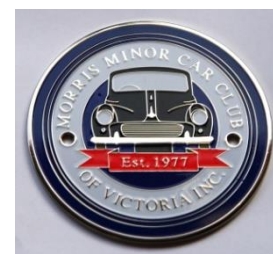
Grille Badge $20