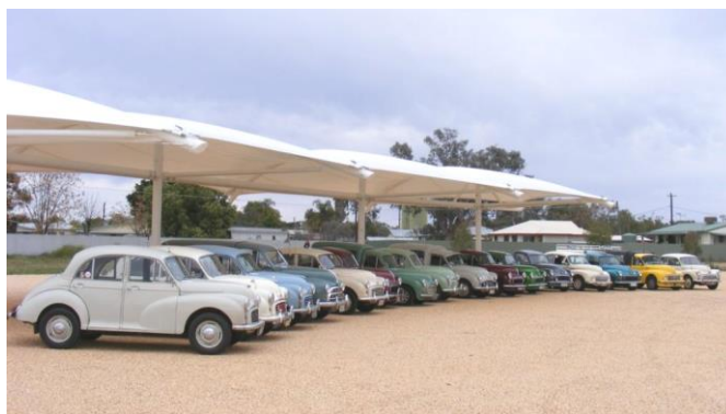
Heading up the line at the Bourke Tourist Centre