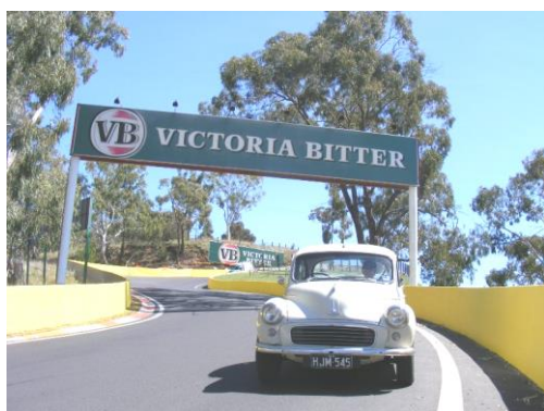
Negotiating the Bathurst Racetrack