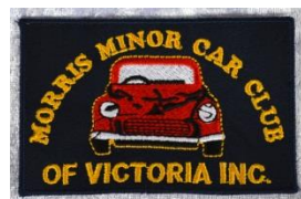
Cloth Club logo patch $10