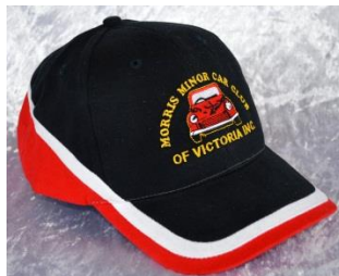
Club Logo Caps $25