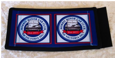
Stubbie Holder $9