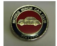
Lapel shirt pins $5