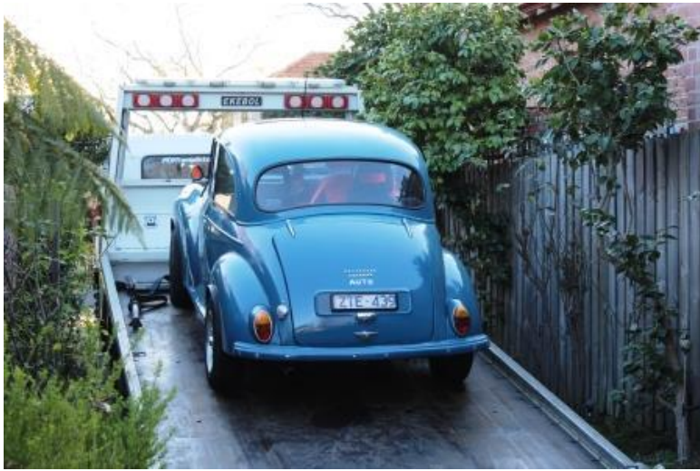
Not a pleasant way to go home