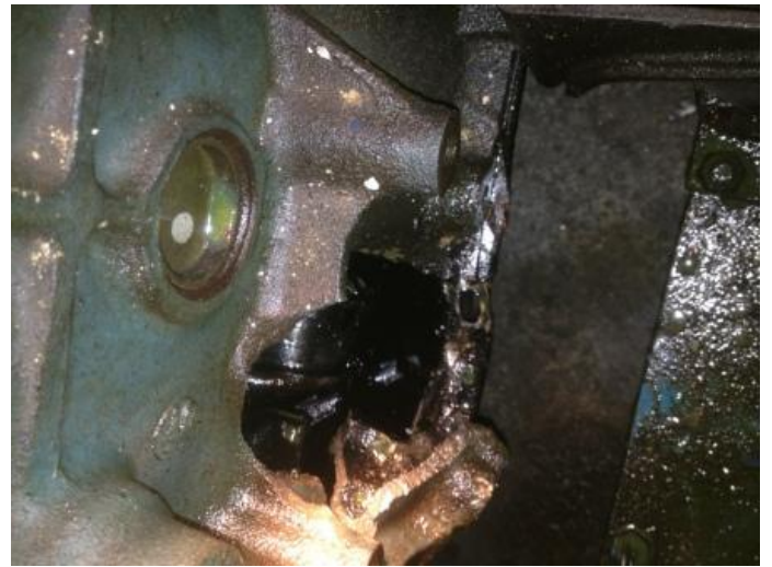
Hmmmm Strange air vent