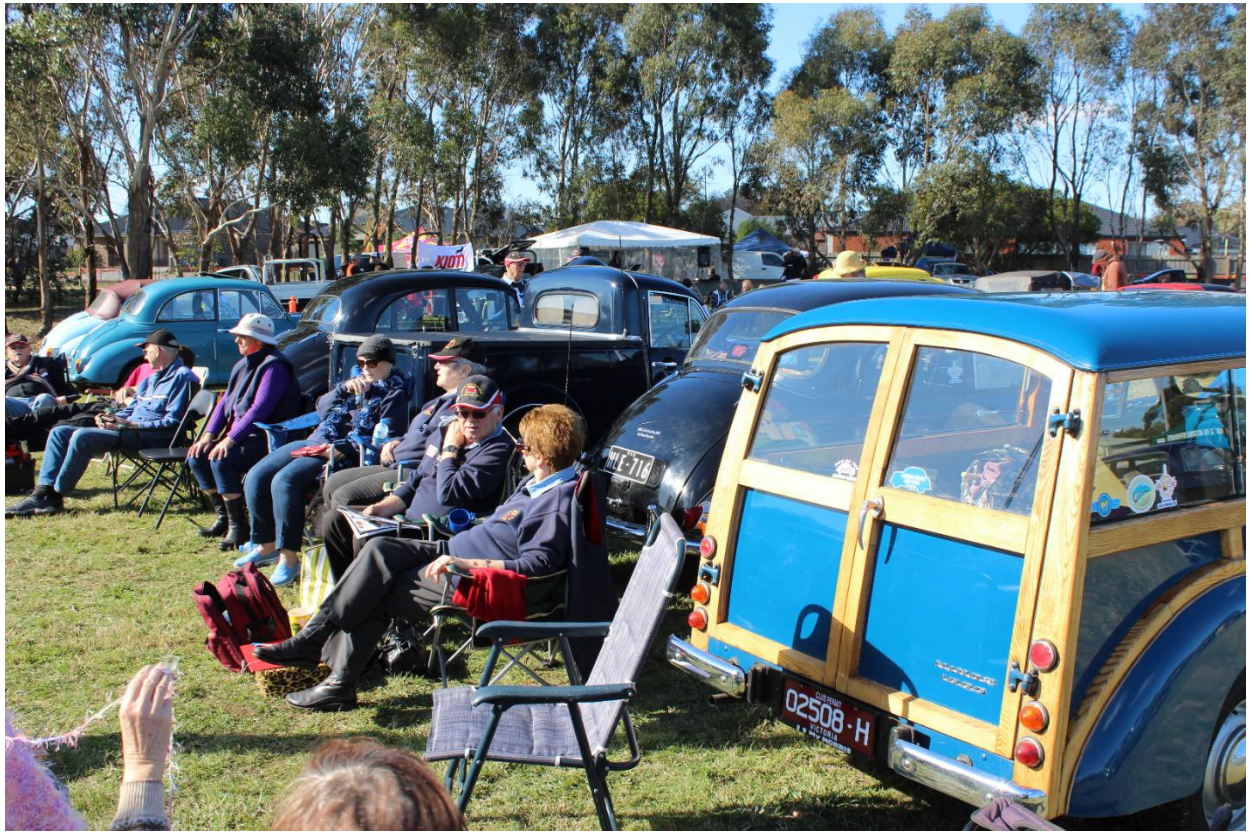
Some club members enjoying the sunshine