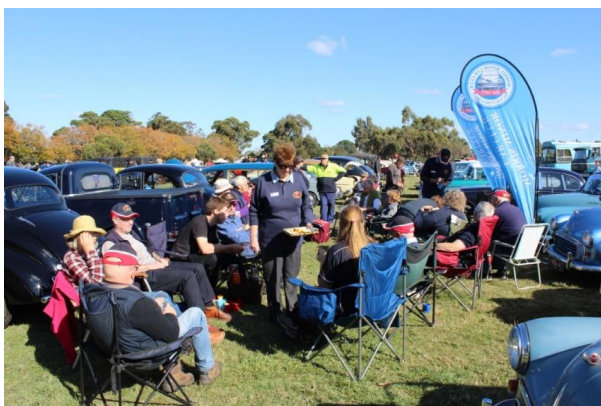
Great day with lovely company