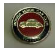
Lapel shirt pins $5