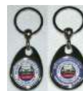
Promo Keyrings $5