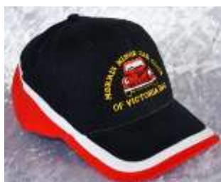
Club Logo Caps $25