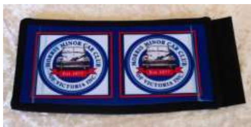
Stubbie Holder $9