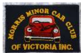
Cloth Club logo patch $10