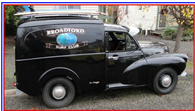
Broadford Surf Club