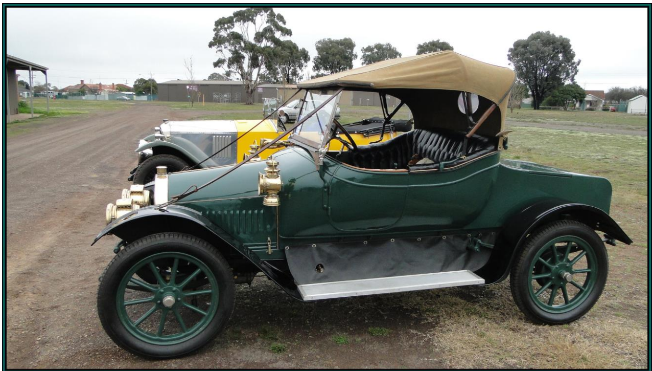
A Star of The Hamilton Ruby Rally – 1913 Fafnir