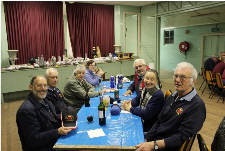
Dinner at Jindera

Saturday night was at the Jindera hall where we had a lovely 2 course meal as well as a mammoth raffle.