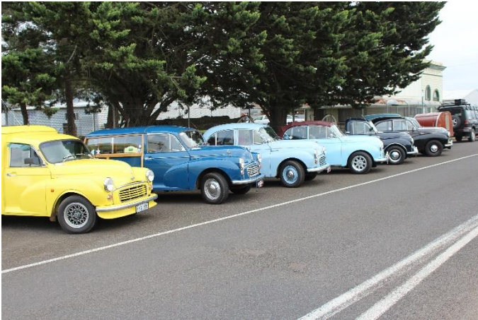
Hamilton Pastoral Museum

Monday morning saw us all sleep in after a fantastic weekend. We checked out of the holiday village at 9.30am and headed to the HDVVCDC club rooms at the Hamilton Pastoral Museum grounds for a leisurely brunch. After we had eaten, we said our goodbyes and headed back to Melbourne via Ballarat. Many thanks to the organisers for a superb weekend. This Queens Birthday rally has been running for 38 years and was so well arranged and executed.