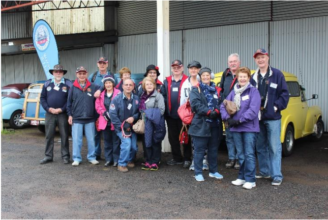
Our cars were given privileged parking

We had a delightful run across the Muntham Hills to Casterton in time for the Australian Kelpie Muster Parade down the main street. (Casterton is 46kms from the South Australian border).