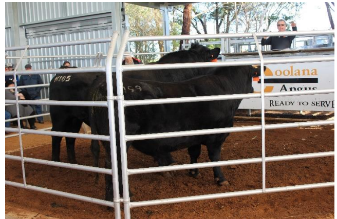
Now that's a lot of bull