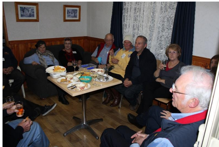
Another Happy Hour in the cabin?

After “The Gums” we returned to Hamilton via Tarrington to get ready for the Gala dinner.