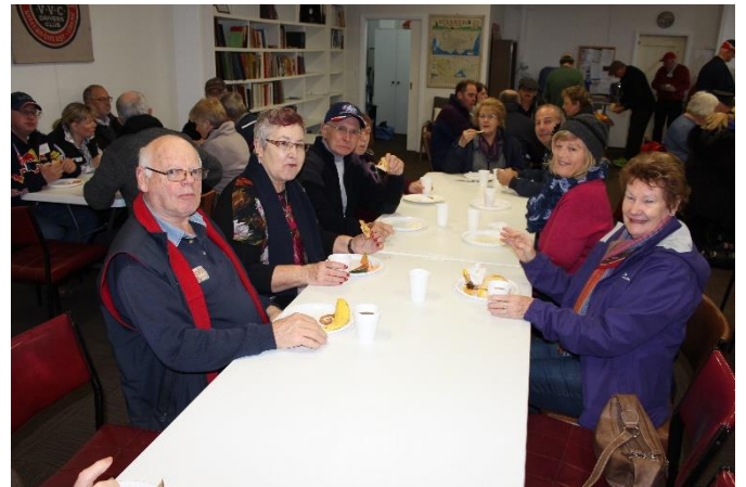
Morning brunch then home

All up we travelled about 1000kms over the weekend.