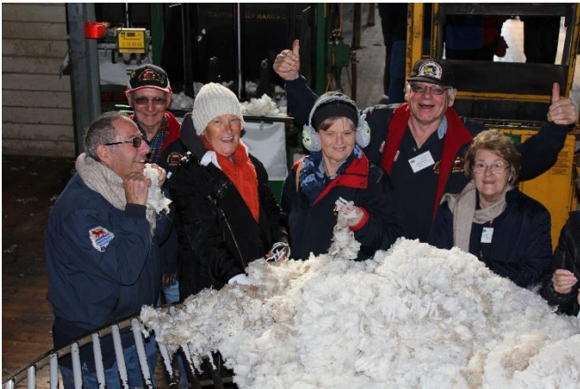
The Gums Shearing Shed

From Penshurst we travelled to “The Gums” Homestead where we first viewed the shearing shed then we went on to the homestead itself. The shearing shed was built in the 1860’s. The owner told us the history of the family property which has been in his family since 1864. The main building was built in 1875.