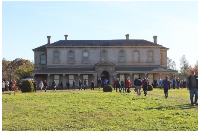
The Gums Homestead

After “The Gums” we returned to Hamilton via Tarrington to get ready for the Gala dinner.