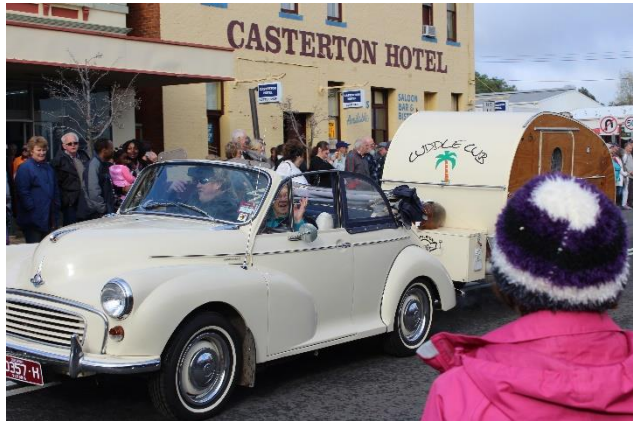
The Muster Parade

During our day in Casterton, we took in the Kelpie dash down the main street, the Kelpie high jump, the iron Kelpie Hill climb, Stockman's challenge, working dog sheepdog trials, and shearing demonstration (using hand shears).