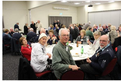
Dinner at the Hamilton Exhibition & Conference Centre

We got up a little later on Sunday as we didn't have to get to Rally HQ until 9am where we assembled to get our instructions for the day.