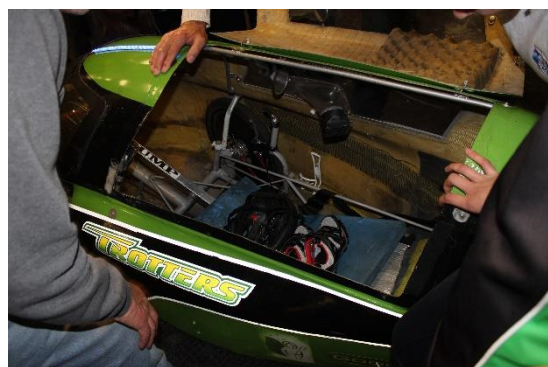
Good Shepherd College's Human Powered Vehicle