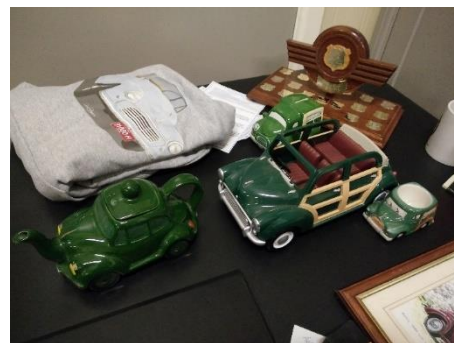
Some of the other items – teapots, egg cups, windcheaters, toys, awards,