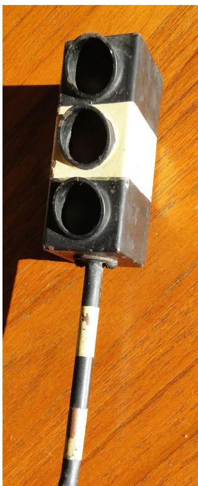
The winning item A functioning traffic light for the inside of the back window of the car. Only 90 mm high. See story on Page 8.