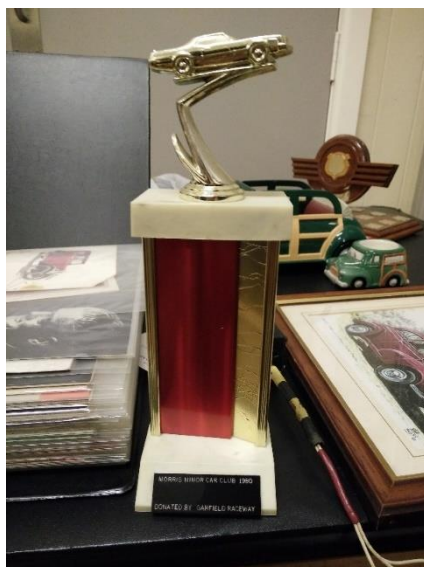
The MMCCV's first trophy ever! Has outlasted the