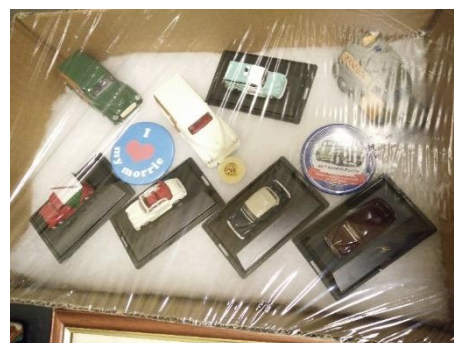
A lovely presentation of Corgi Morris Minors and other things.