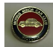
Lapel shirt pins $5