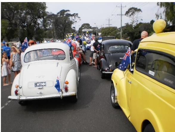
Waiting to start the parade