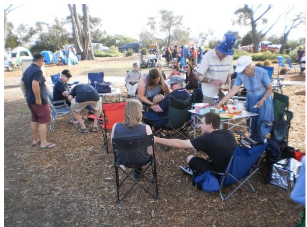
At the BBQ after the parade