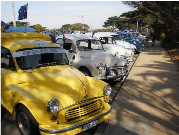
Line up at Schnapper Point