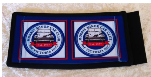
Stubbie Holder $9