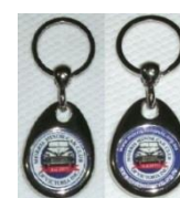
Promo Keyrings $5