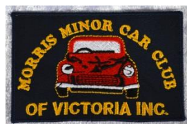
Cloth Club logo patch $10