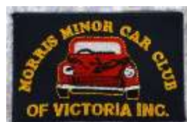
Cloth Club logo patch $10