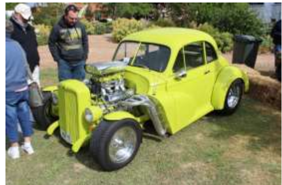
Interstate Visitor (SA)