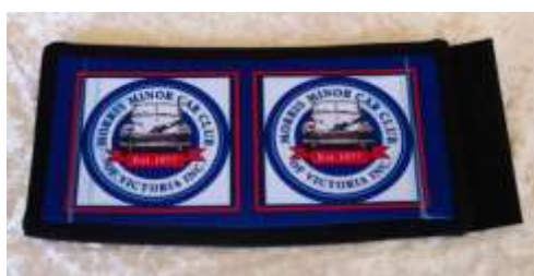
Stubbie Holder $9