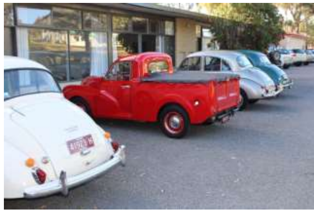
Our Accommodation at North Harcourt

Up and off to the garage at 8am the next morning to get set up. Signage, gate people, parking directions, stalls, toilets, all well thought out and acted on. The weather was brisk but we were assured the sun would show itself at 1.00 which it did right on time.