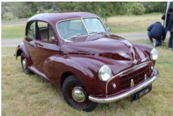
Interstate Visitor (QLD)