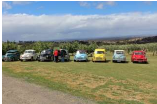
The workers cars

There were a number of interesting stalls and I bought quite a bit of booty. There was the locally made olive oil which is too good the cook with, from the McKellar farm, there was marmalade from the CWA, and not to forget the cider from Henrys of Harcourt. I definitely reduced the carbon miles on these goods. The other highlight of the day was the band - live music is always a treat and this was a local brass band which has been around a long time. They were great and some of them bought their vintage cars as well.