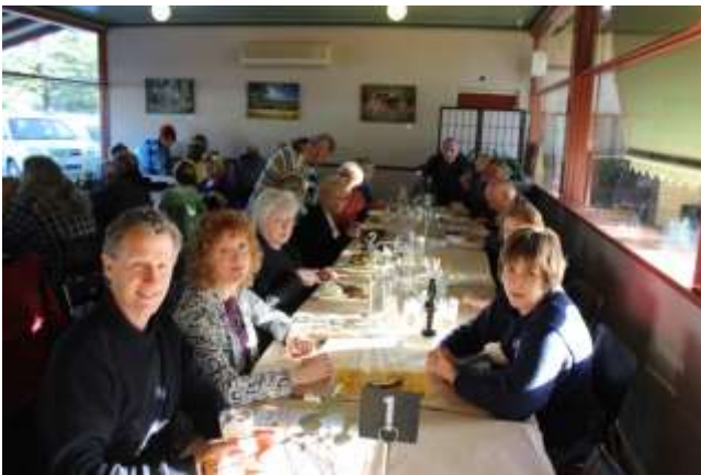
Dinner at Treads Restaurant