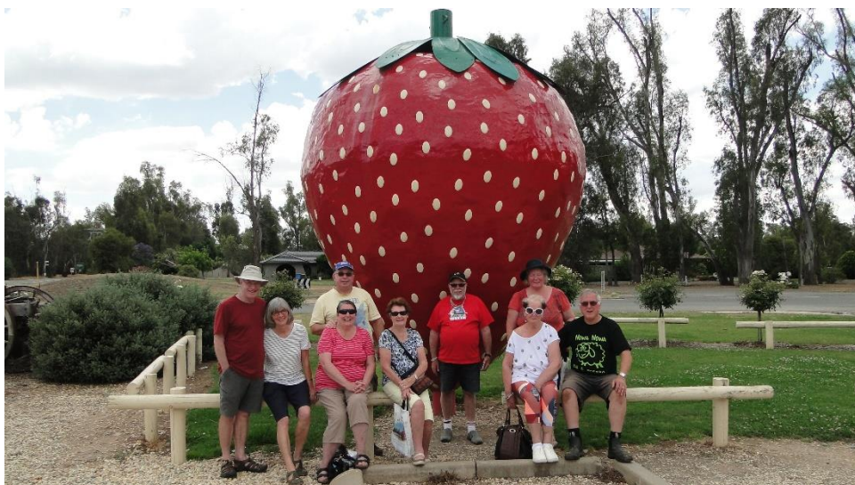
The Cobram Cobbers at The Big Strawberry.