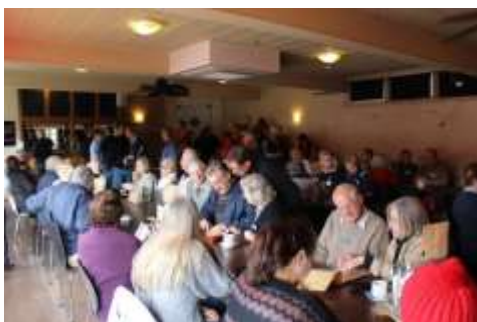
Lunch at the Old Hepburn Hotel