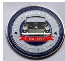
Grille Badge $20