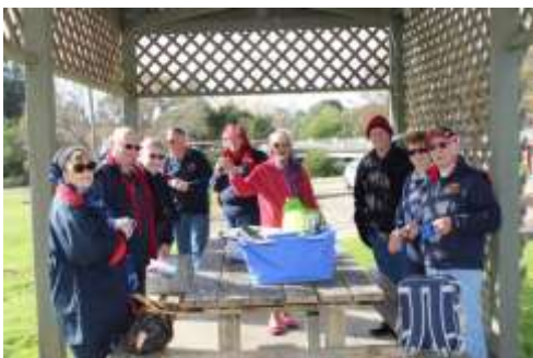
Morning Tea at Ballan