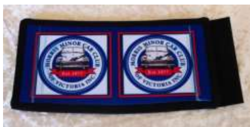
Stubbie Holder $9