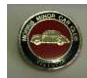
Lapel shirt pins $5