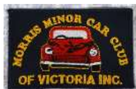
Cloth Club logo patch $10