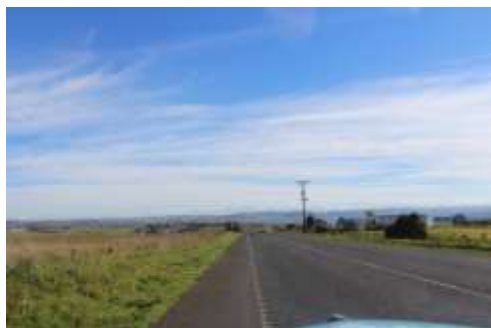
On the road to Bacchus Marsh

We all began meeting at Rockbank from 9am and we got away at 9:30 to head to Ballan via some back roads through to Bacchus Marsh then on to Ballan. At Ballan we met up with members of the Geelong Club for morning tea.