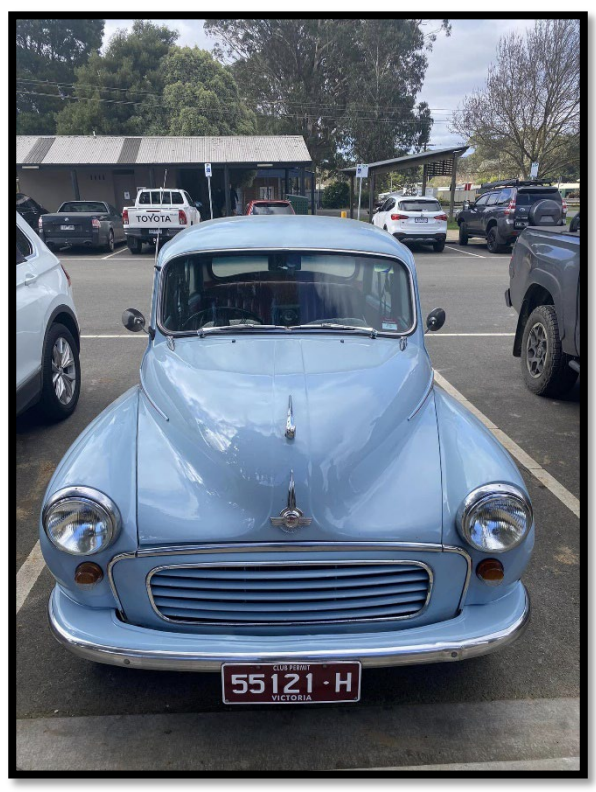
Page 14 of 16