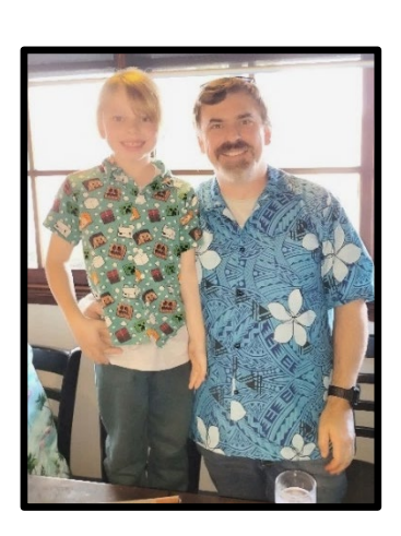
Page 12 of 16