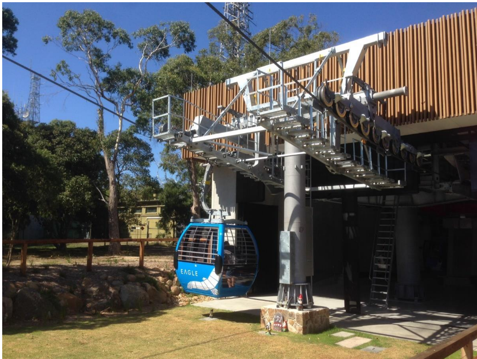
The New Arthurs Seat Chairlift

Leaving the BP servo at around 11am the complete Group of 16 then enjoyed a most scenic route mapped out by Mark to the Arthur's Seat/ Seawinds overflow car park where the Group split up to either view the new chairlift development or walk to the great sea view at Seawinds or stay put for a cuppa. After an hour of our chosen activity we then set off down the steep incline passing under the chairlift and then a short drive to our very welcoming hosts Mario and Teresa, arriving shortly after 1pm.