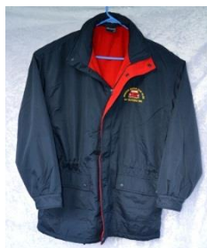
Long Line Jacket $70