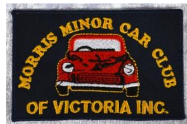
Cloth Club logo patch $10