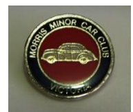
Lapel shirt pins $5