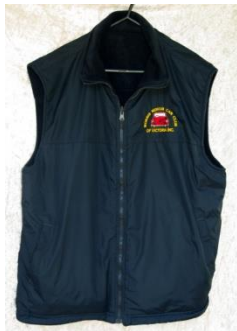
Reversible Vest $45

For purchases contact Graham Harper - 03 9439 5791 regalia@morrisminorvic.org.au