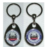
Promo Keyrings $5