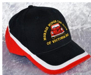
Club Logo Caps $25