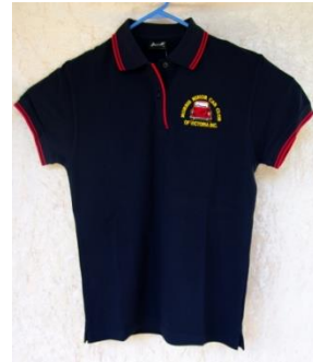
Short Sleeve Polo $30