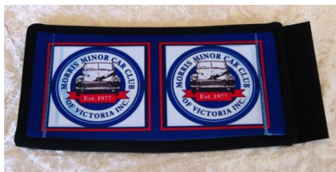
Stubbie Holder $9