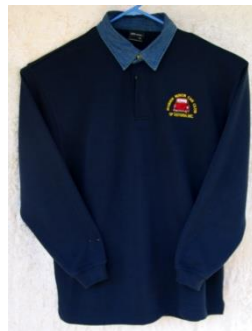
Long Sleeve Rugby $40