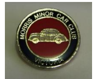
Lapel shirt pins $5