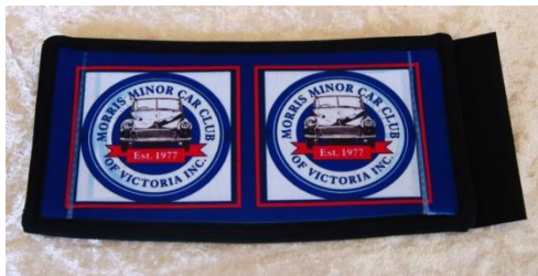
Stubbie Holder $9