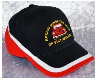
Club Logo Caps $25