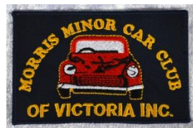
Cloth Club logo patch $10