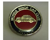
Lapel shirt pins $5