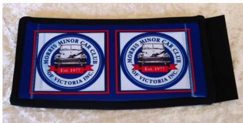
Stubbie Holder $9