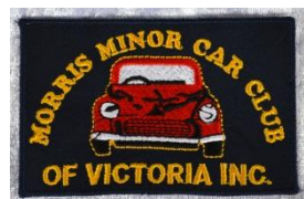
Cloth Club logo patch $10