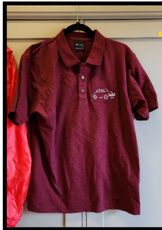
Polo Shirt $35 order from Alan Todd