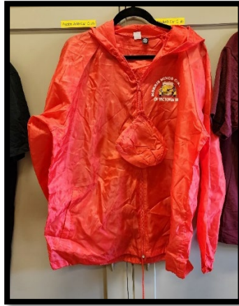
Rain Coats – red, black and blue $22.00 each