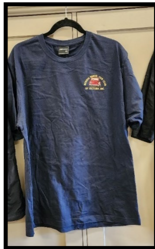
T Shirt - $25.00