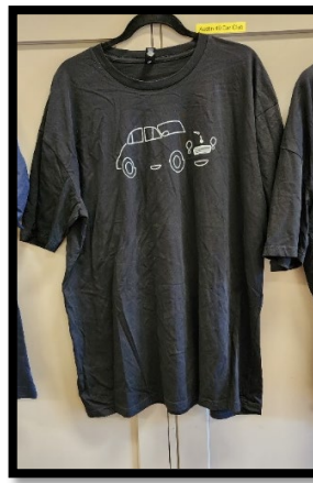
T Shirts $25.00 each