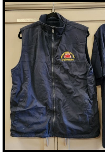
Sleeveless Vest – price available from Alan Todd