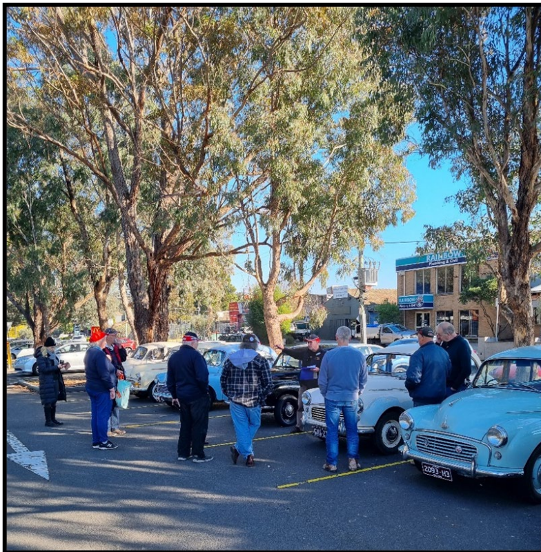
Gathering before setting off on the May Run to Panton Hill